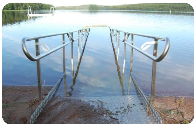
Easy to install for summer and easy to take up for winter

EasyTrail® is a maintenance-free leisure swimming ramp that makes swimming spots more accessible, safe, and inclusive. It was developed in collaboration with the Innovation centre for the disabled in Kronoberg, Sweden.