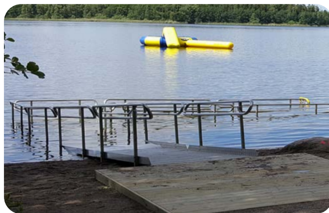
Maintenance-free design in stainless steel quality